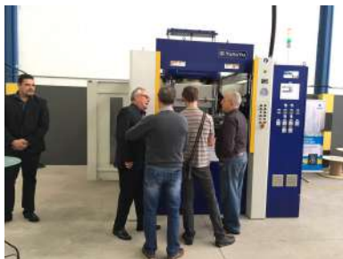
TYC series Compression molding machine